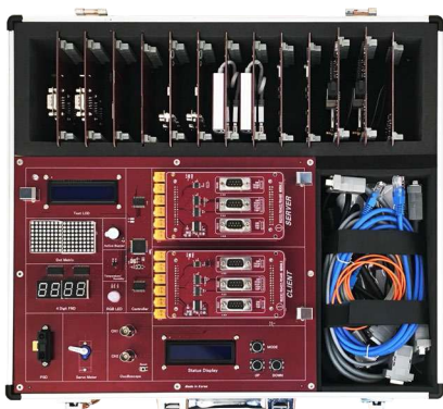
CM-028 Data Communications