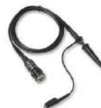
Oscilloscope Probe 2EA