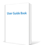
User Guide book 1EA